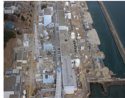
Joint military exercise 'Sada Tansiq'

(C) Japan plans to release about 54,600 tons of nuclear contaminated water from the plant into the sea this fiscal year. Tokyo Electric Power Co., operator of Japan's Fukushima Nuclear Power Plant, plans to release about 54,600 tons of nuclear contaminated water from the plant into the sea in fiscal year 2024.